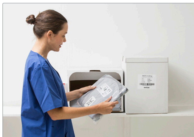
Disposable product supplied in packaging which makes it easy to store and take out a new sling when needed.

Molift EvoSling Soft Padding For pressure-sensitive users EvoSling Soft Padding consists of pressure-relieving padded sleeves which are slipped over the leg parts of slings with split-leg support. Washable at 40°C.