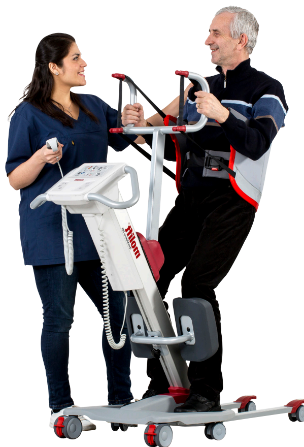
The image includes Active lifting arm & RgoSling Active.

Easy to operate in moving and handling situations; toilet, sit-to-stand and stand-up training.